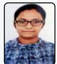
KASHISH BA-III 80%