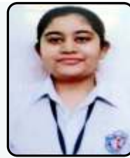
VRIDHI BA-I 75.40%