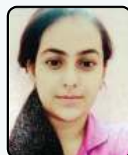
PALAK B.COM H-I 76.90%