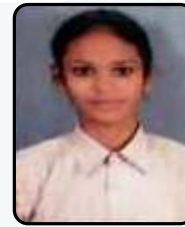
ESHITA B.COM H-I 75.09%