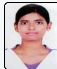
KGSRI BBA-I 72.30%