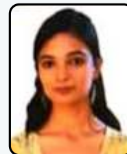
RISHAM B.COM H-II 78.16%