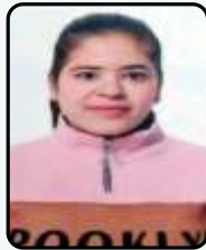
ROZY MA ENG-II 7.5 SGPA