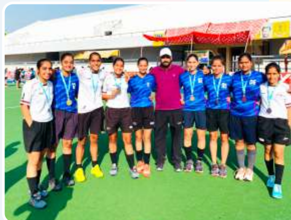
HOCKEY GIRLS Gold in Kheda Wattan Punjab Diya, Jalandhar

MEN AND WOMEN HOCKEY TEAMS BAGGED SECOND POSITION IN PUNJABI UNIVERSITY INTER COLLEGE HOCKEY TOURNAMENT