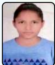
DAKSHI MA HIST-I 7.25 SGPA