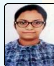
KASHISH BA-III 80%