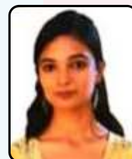
RISHAM B.COM H-II 78.16%