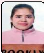
ROZY MA ENG-II 7.5 SGPA