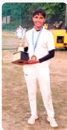
DAKSHI North Zone Women Inter University Cricket Tournament, Una, Himachal Pradesh

GIRLS EXCEL AND SHINE IN SPORTS, EARNING LAURELS