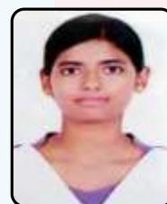
KGGSRI BBA-I 72.30%