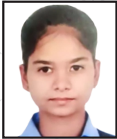
ISHU B.COM H-I 92.18%