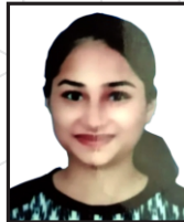
MIKSHA M.COM-II 9 SGPA