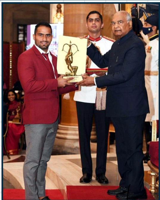
SANDEEP NARWAL ARJUUNA AWARDEE IN KABADDI (NS)