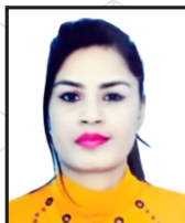
EXTA DHALIA MA ENGLISH-II 9.00 SGPA