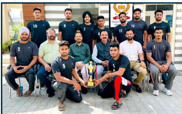
WINNER INTER COLLEGE KABADDI (CS) CHAMPIONSHIP PUNJABI UNIVERSITY PATIALA