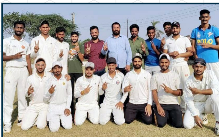
3RD PLACE IN PUNJABI UNIVERSITY PATIALA INTER COLLEGE CRICKET CHAMPIONSHIP