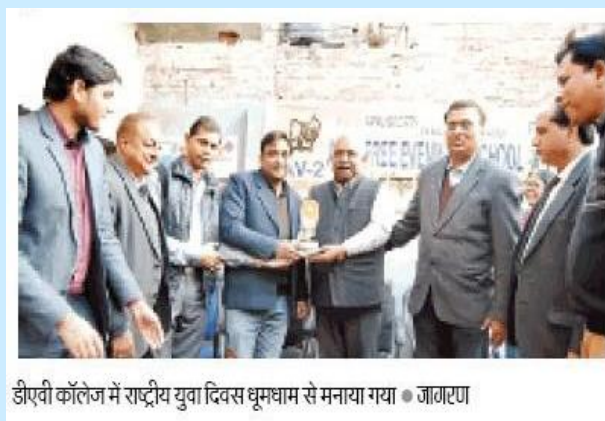
डीएवी कॉलेज में राष्ट्रीय युवा दिवस धूमधाम से मनाया गया • जागरण

The Red Ribbon Club and NSS unit of the college on the occasion of National Youth Day made a visit to the school run by Appu Society in Dhobiana Basti for the under privileged. The NSS volunteers distributed stationery items and eatables among the students and expressed their wish to join the Appu Society in order to do their bit for the deprived children on 16.01.2018.