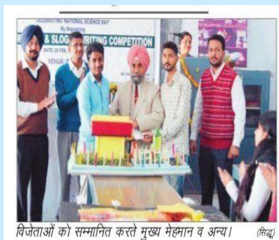
विजेताओं को सम्मानित करते मुख्य मेहमान व अन्य।