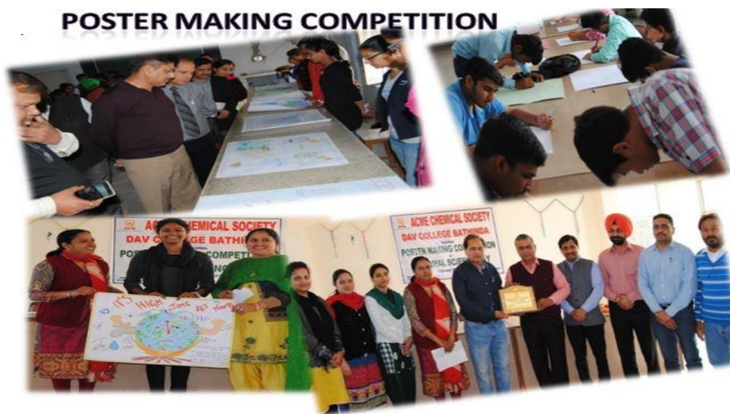
Sketching the thoughts on Paper

Competition provides motivation to achieve a goal; demonstrate creativity and perseverance to overcome challenges; and to understand that hard work and commitment leads to success.