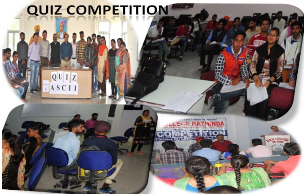
Learning through competitions