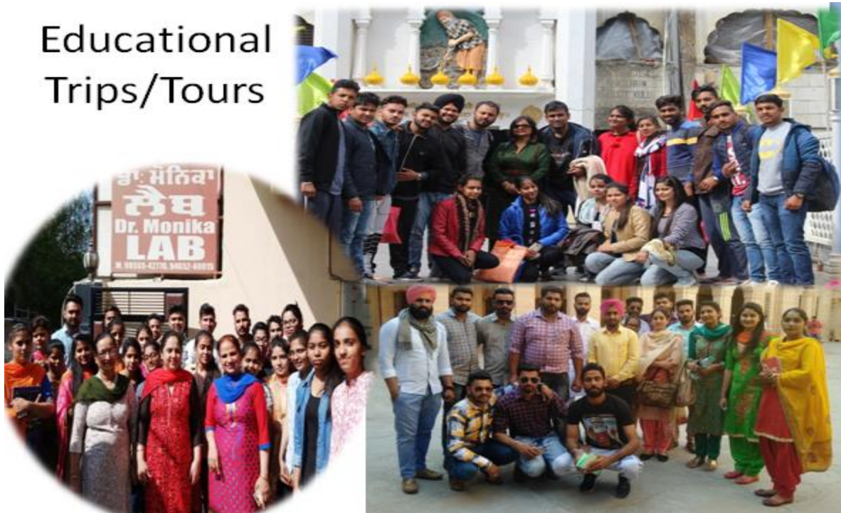
Gaining through field visits