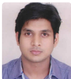
M.Com-I (8.13 CGPA)